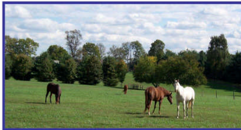
Sleepy Hollow Golf Course