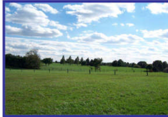
McWilliams Farm/Sleepy Hollow Golf Course