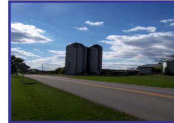
Hwy 1694 near Hwy 329