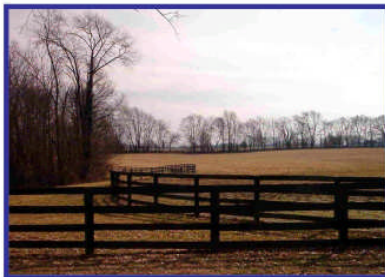
Fox Hollow Area