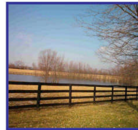
Wetlands off Hwy 329