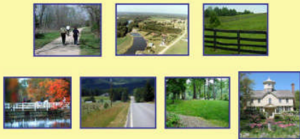
Rated as Very Appealing Overall